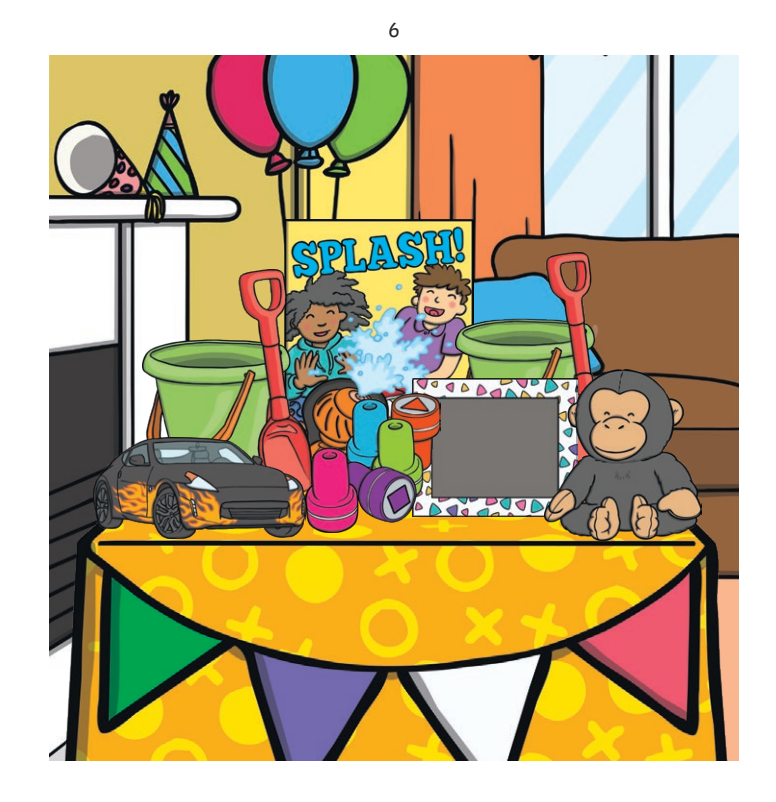
Here are all the gifts. We got the same bucket and spade for the beach from Gran and Grandad.

Sam and Dad put up bunting and got games from the box.