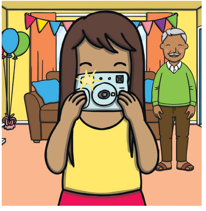
Grandpa Dada had a camera to take snaps.