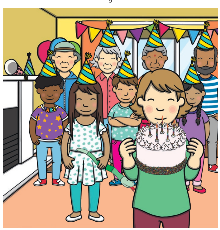
Here we are playing the snake game. Then, Mum came with the cake and we sang.