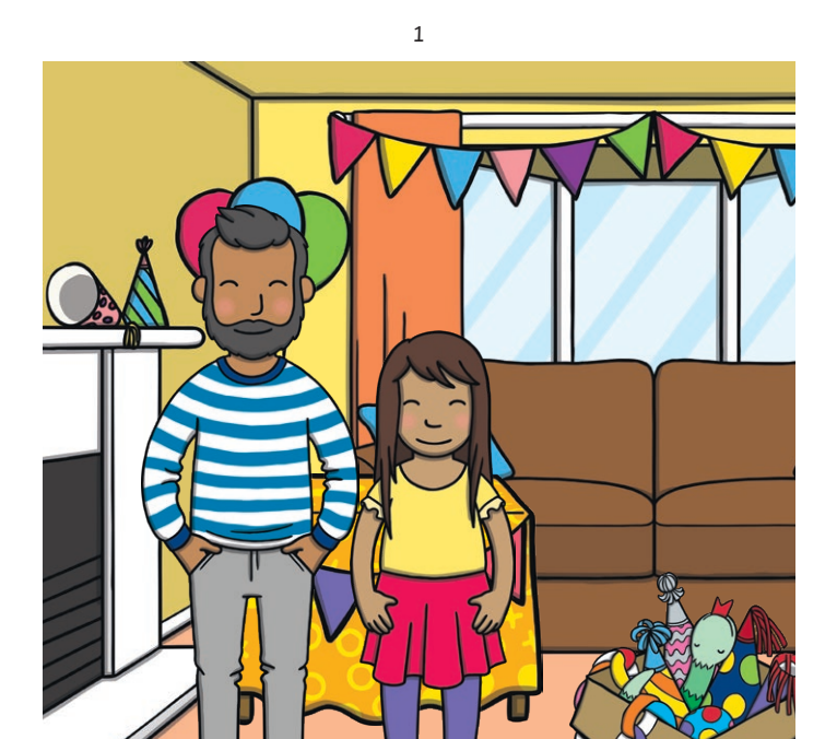
We had to make the rooms look neat.

Sam and Dad put up bunting and got games from the box.